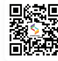
Scan to view more FYPs

Chingay 2025 The team designed a Chingay float which showcased hawkker culture, with a young female hawkker presenting diverse dishes that symbolizes unity.