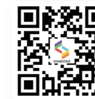
Scan to view more FYPs

"Scam Campaign" For this project, the team collaborated with Mediacorp through their Scam Campaign, #ScamAlert, where they researched about the various scam personas. This project aims to educate users in an enjoyable yet impactful way. The team also hope to raise awareness and educating the public on the growing problem of scams.