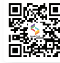
Scan to view more FYPs