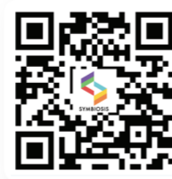
Scan to view more FYPs

Singapore Needs You, What's Your Role? The project focuses on creating narrative videos for the SGSecure Programme Office (SSPO) to educate youths aged 15-35 and the public on the importance of staying vigilant and reporting suspicious behaviors or signs of radicalization. Using an abstract storytelling approach, the videos metaphorically emphasize vigilance, resilience, and community roles in preventing and responding to terrorism. The initiative aims to equip audiences with knowledge and inspire collective responsibility to keep Singapore safe from terror threats.